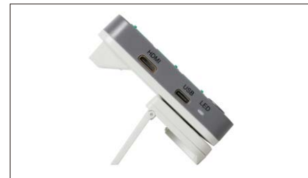
side and back

after the handle is folded, the magnifier can be directly placed on the object for observation