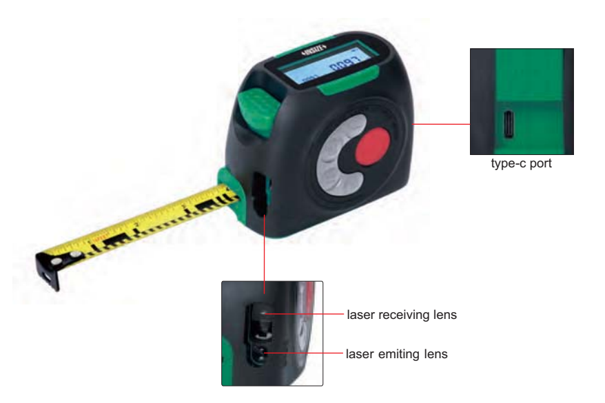
digital measuring tape