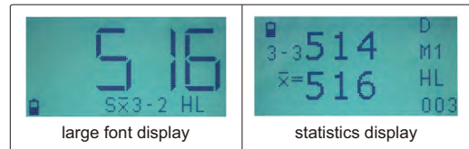
large font display