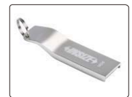
software flash disk (included)