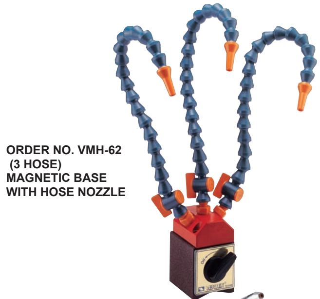
ORDER NO. VMH-62 (3 HOSE) MAGNETIC BASE WITH HOSE NOZZLE