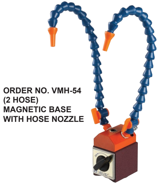
ORDER NO. VMH-54 (2 HOSE) MAGNETIC BASE WITH HOSE NOZZLE