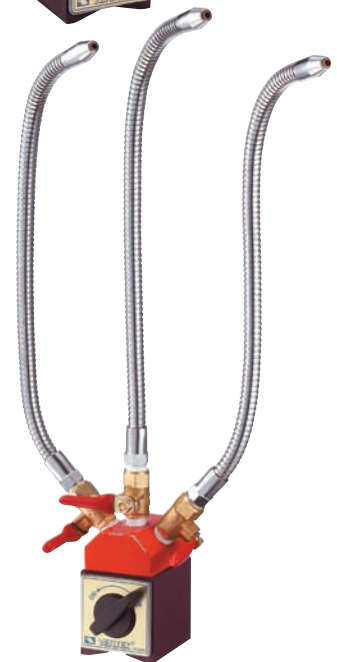
ORDER NO. VMH-65 (3 HOSE) MAGNETIC BASE WITH STEEL NOZZLE