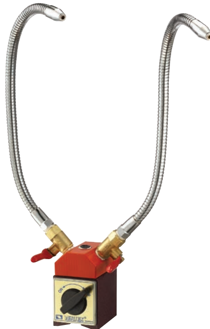
ORDER NO. VMH-64 (2 HOSE) MAGNETIC BASE WITH STEEL NOZZLE