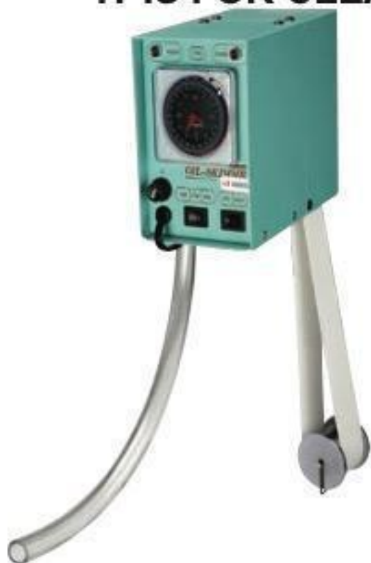
ORDER NO. VOS-800

IT IS FOR CLEAR FLOATING OIL ON CUTTING LIQUID.