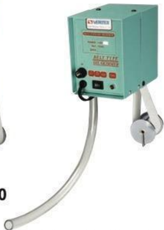
ORDER NO. VOS-810