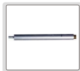
extension rod (included)