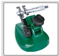
micrometer stand with clamp (optional)