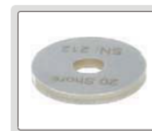
calibration block (included)