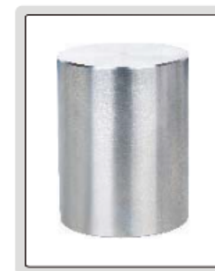
4kg weight block (optional) for ISH-S30D