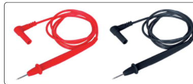
test leads (included)