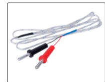
temperature probe (included)