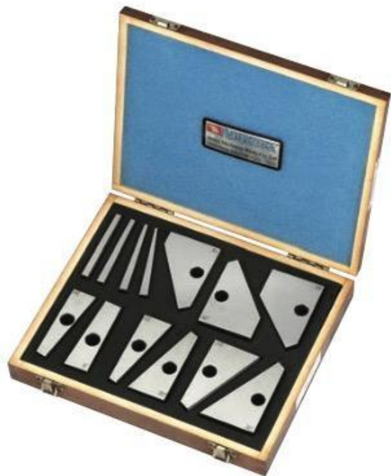
TOP PLATE 1°, 2°, 3°, 4°