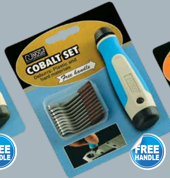
Cobalt Set NG8250 INCLUDES: NogaGrip-1- handle - NG1000 20 pcs. S100 blades - BS1018