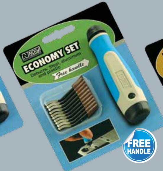
Economy Set NG8200 INCLUDES: NogaGrip-1- handle - NG1000 20 pcs. S10 blades - BS1010