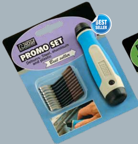
Promo Set NG8150 INCLUDES: NogaGrip-1- handle - NG1000 10 pcs. S10 blades - BS1010