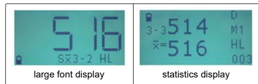
large font display