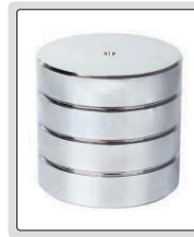
weight block D (optional) for ISH-DSD