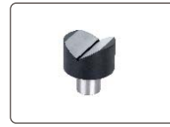
V-type anvil (included) for cylinders with diameter Ø4~60mm