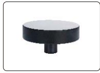
Ø63mm flat anvil (included)