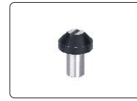
small V-type anvil (optional) for cylinders with diameter Ø2~4mm