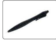
touch pen (included)