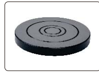
Ø150mm flat anvil (included)