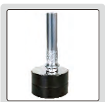
test flat surfaces (with the cover)