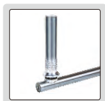
test cylinder surfaces (use V-groove on the cover)