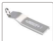
software flash disk (included)