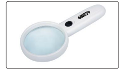
2X magnifier (included)