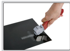
step 1: make grid cutting on surface