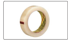
test tape (included)