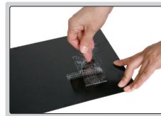
step 2: paste and remove the tape