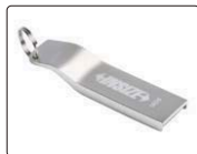
software flash disk (included)