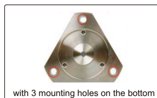
with 3 mounting holes on the bottom