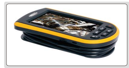
cable can be wrapped around the main unit