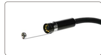
magnet pick up(included)