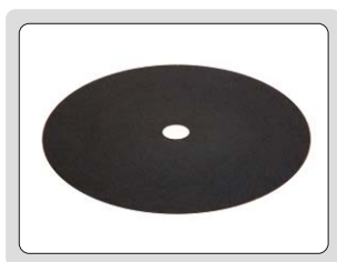
cutting blade, MLP-50Z2(included)