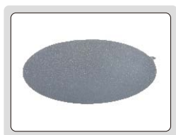
silicon carbide paper (included)