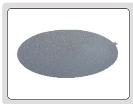
silicon carbide paper (included)