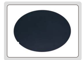
anti-stick disc (optional)