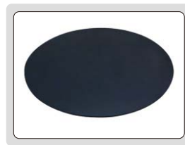
magnetic pad (optional)