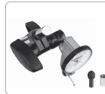
holding dial test indicator through Φ4mm clamp