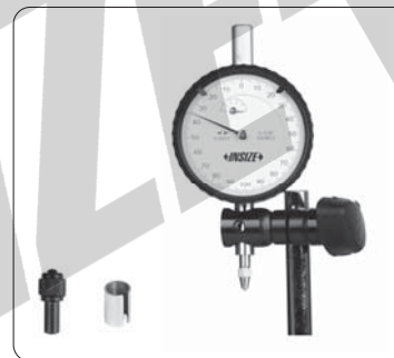
holding stem 3/8" DIA.