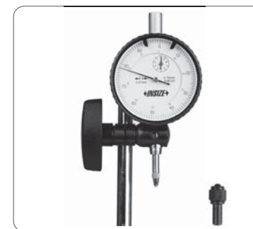
holding stem Φ8mm