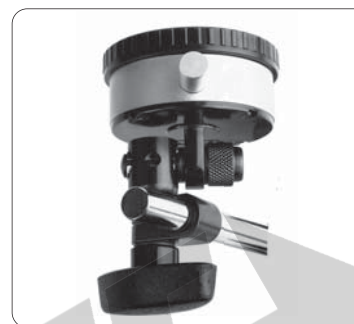
holding lug back

1. This magnetic stand is for digital/dial indicators and dial test indicators. Holding as follows: