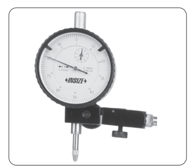
holding stem \Phi 8 mm in metric/ 3/8" DIA in inch