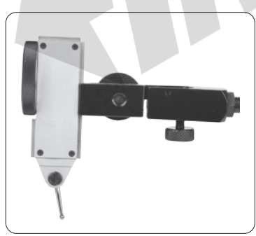
holding dovetail groove