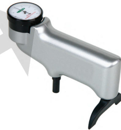
ISHB-B300 BARCOL HARDNESS TESTER OPERATION MANUAL