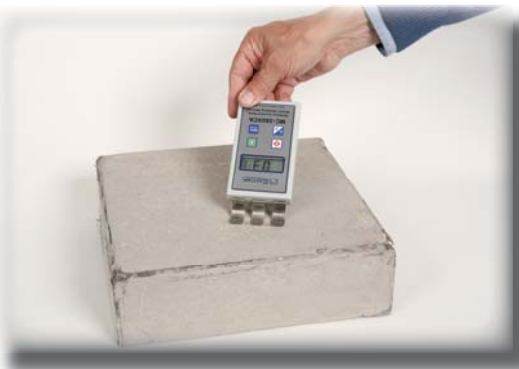
Measuring depth 100 mm - Scans the complete Concrete slab.