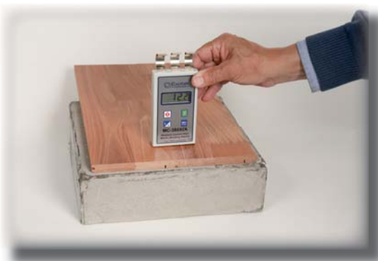
Measuring depth 10 mm - Measures only the wooden floor