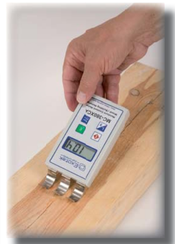
Measuring depth 100 mm, - Can detect moisture cavities in a wooden beam