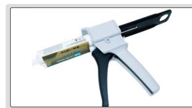
Glue gun and glue(included)