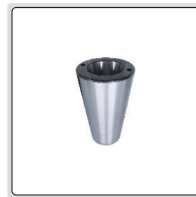
BT50/BT40 converter (optional)