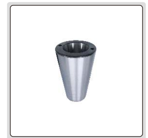
BT50/BT30 converter (optional)