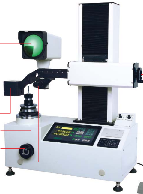
X axis moving handle wheel