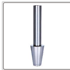
standard rod (included)