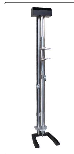
large deformation extensometer (optional)