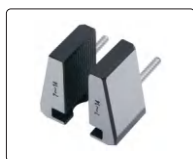
flat jaws (included)