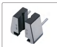
V-shaped jaws (included)