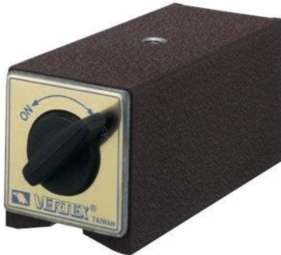
ORDER NO. VMB-11 MAGNETIC BASE ONLY M8X1.25p,140kgs