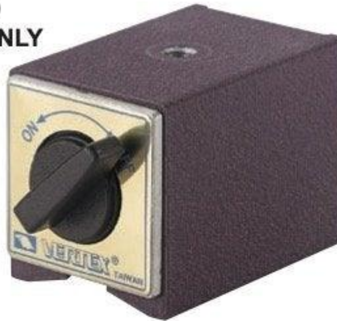
ORDER NO. VMB-10 MAGNETIC BASE ONLY M8X1.25p,100kgs