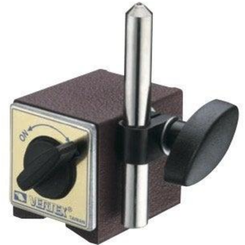
ORDER NO. VMB-12 WHEEL DRESSER CLAMP HOLE 12MM WITHOUT DIAMOND DRESSER PEN Page B65