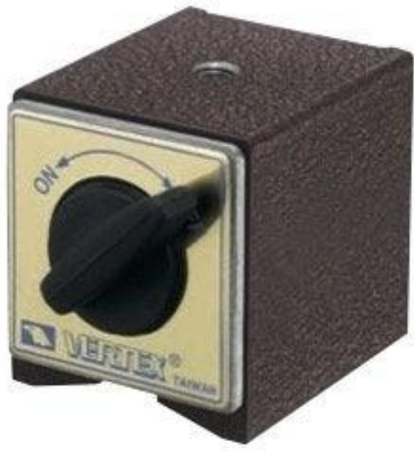
ORDER NO. VMB-00 MAGNETIC BASE ONLY M8X1.25p,80kgs