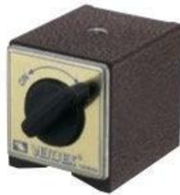
ORDER NO. VMB-09 MAGNETIC BASE ONLY M8X1.25p,30kgs