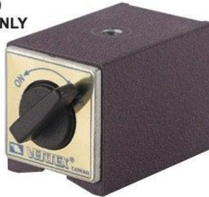
ORDER NO. VMB-10 MAGNETIC BASE ONLY M8X1.25p,100kgs