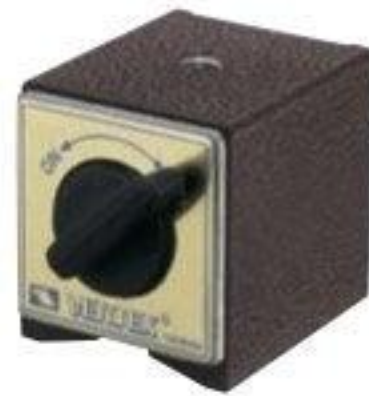
ORDER NO. VMB-09 MAGNETIC BASE ONLY M8X1.25p,30kgs