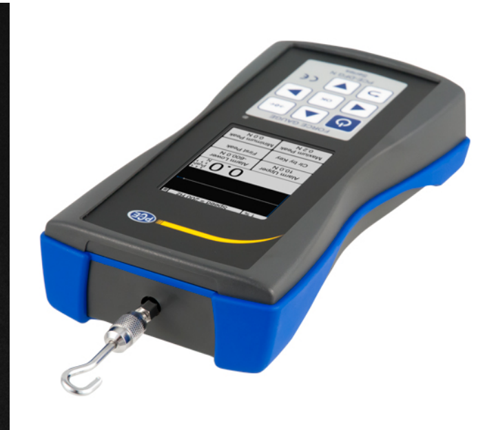
PCE-DFG N 5 Force gauge

For tensile force measurement and pressure force measurement up to 5 N / Very high accuracy / Sampling rate 1600 Hz / 6 different measuring tips / USB interface / Software / Calibration certificate