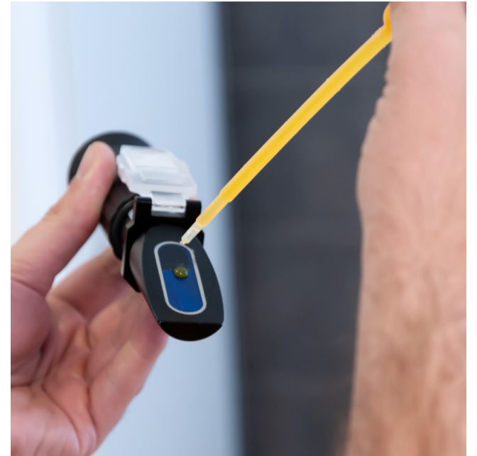
LED Refractometer PCE-Oe-LED