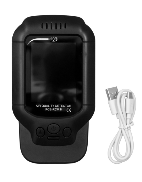
Environmental meter PCE-RCM 8

Indoor / Battery-powered multi-function particle counter / LC display / Mass concentration PM 1.0, PM 2.5, PM 10 / Formaldehyde / Alarm function / Temperature measurement / Foot stand / Switchable display