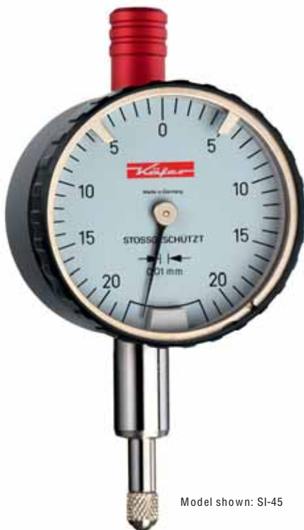
Model shown: SI-45