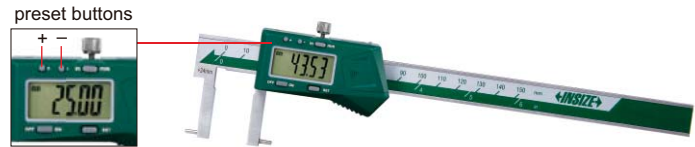
1121-150A type A