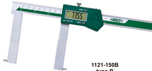
1121-150B type B