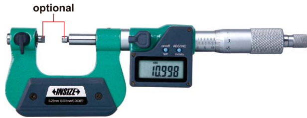
3581-25A (measuring tips are optional)