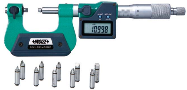
3581-S50 (measuring tips are included)