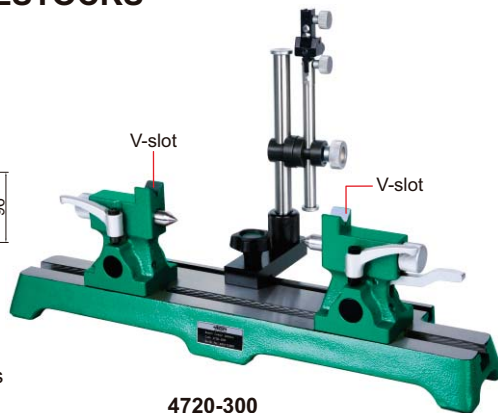
roller tailstocks (included)