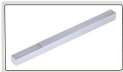
calibration block (included)