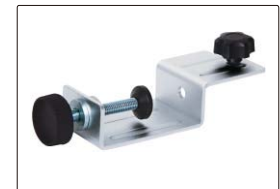
stand (included with outdoor detector)