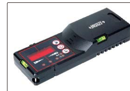
outdoor detector ( optional )

* Use high accuracy detection mode within 15m, use low accuracy detection mode over 15m