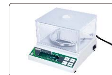
windshield (included in 8301-300 , 8301-600 and 8301-1200 )