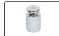
calibration weight (included in 8301-300 , 8301-600 and 8301-1200 )