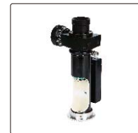
measuring microscope (included)