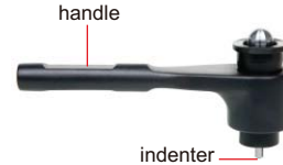
impact test handle