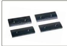
supports for cylinder or tube workpieces (included)