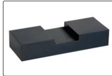
flat anvil for test block (included)