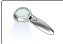
magnifier with LED (included)