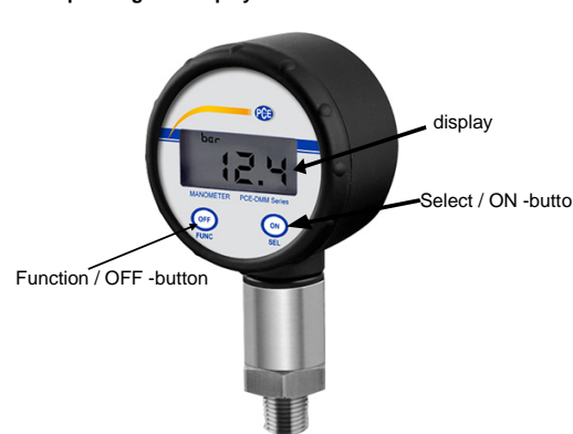
Fig. 2 LC-Display